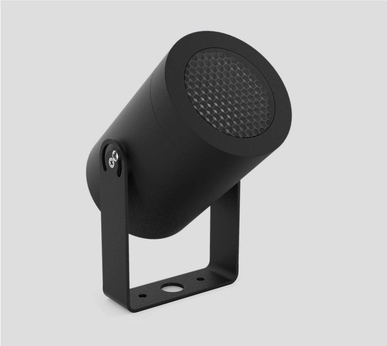
Shown with Optional Honeycomb